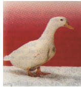
Ducks & trout are the most susceptible species