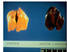
HEPATOMEGALLY CAUSED BY AFLATOXICOSIS